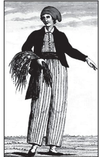
'MAD LLA BARÈ', Engraving, artist unknown. From Navigazioni di Cook pel grande oceano e intorno al globo, Volume 2, 1816, Sonzogono e Comp, Milano.

Women were not welcome on sailing ships at this time. In September 1817 this woman joined her husband on the Uranie disguised as a man until they left port. She completed an account of the three-year circumnavigation in a series of letters which took the form of a diary. She recorded many things about the journey in the diary.