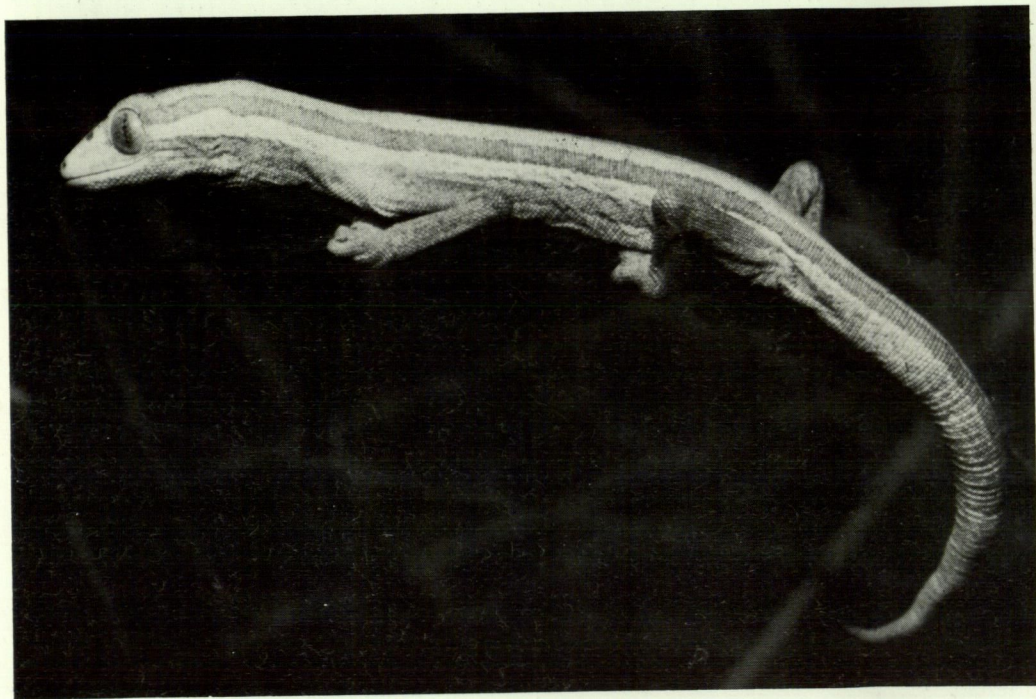
Figure 1 A Diplodactylus jeanae from 9 km NW of Barradale, W.A..

The foregoing describes the pattern in the darkest specimens. However the dark stripes are usually paler and less extensive and are often hollow (i.e. only their dark edges are discernible).